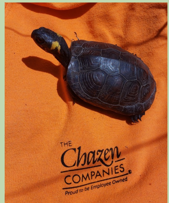
Bog turtle ( Glyptemys muhlenbergii)